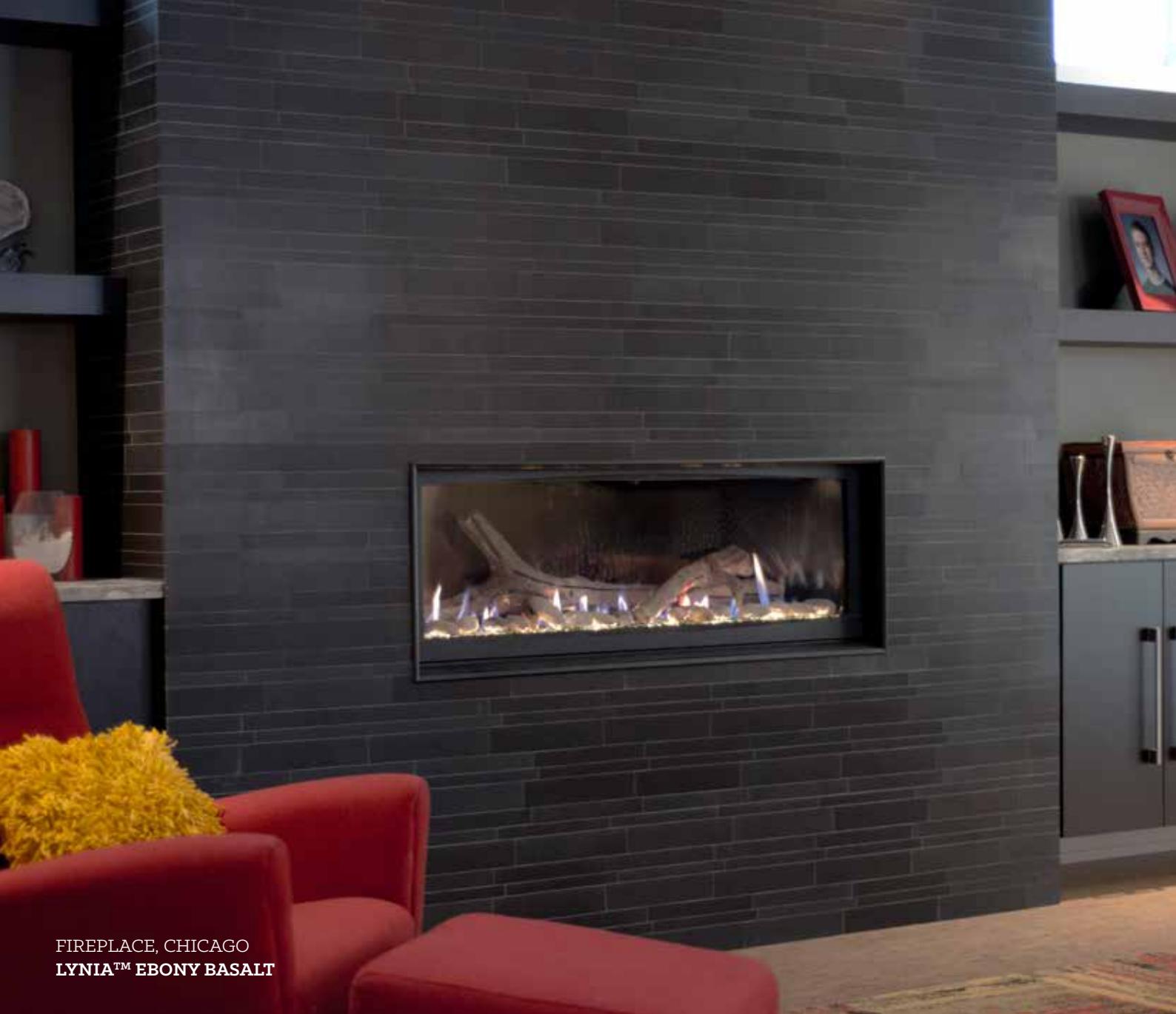
FIREPLACE, CHICAGO LYNIA™ EBONY BASALT