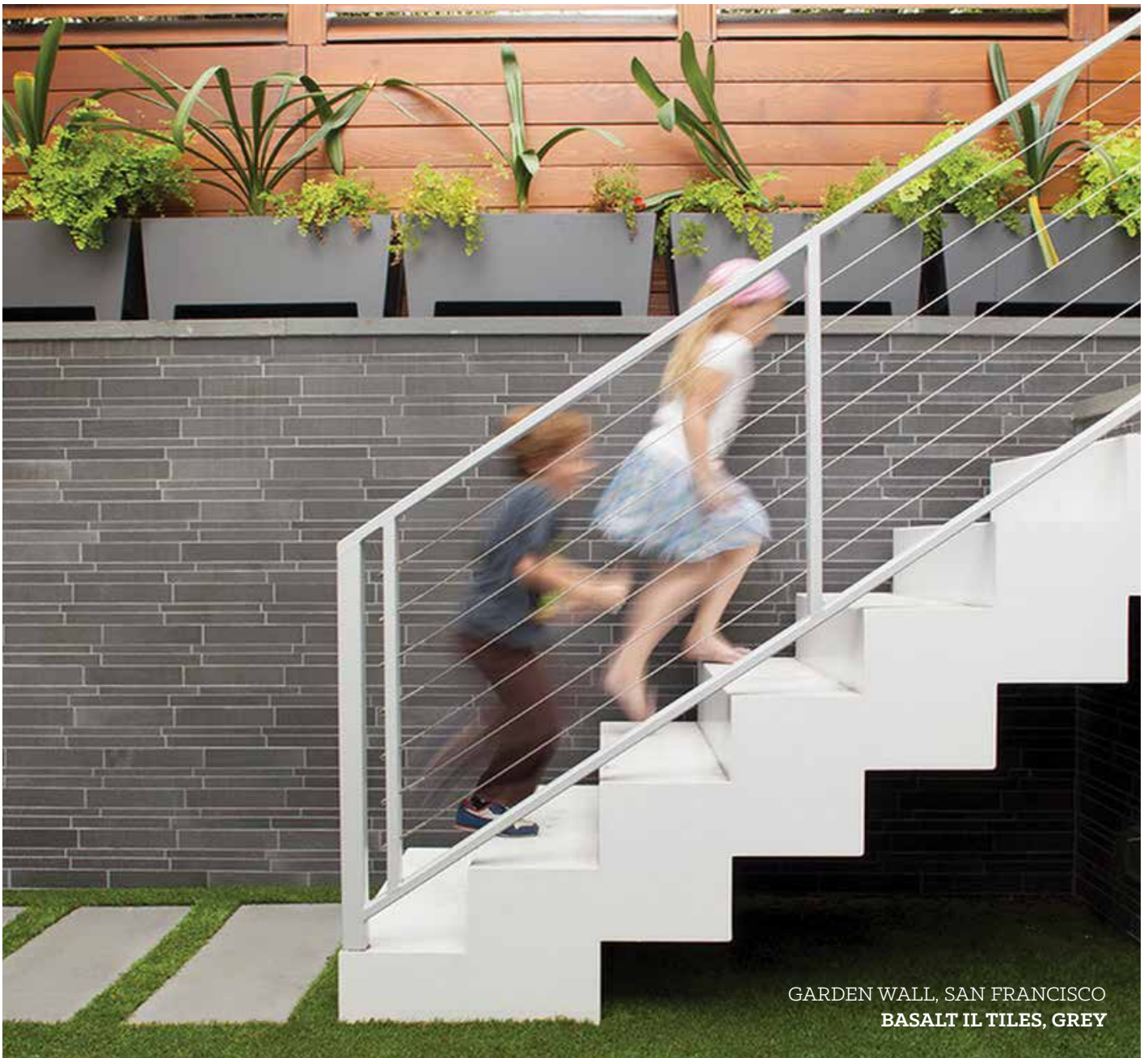
GARDEN WALL, SAN FRANCISCO BASALT II TILES, GREY

WANT TO STAND OUT FROM THE CROWD? CROWD?